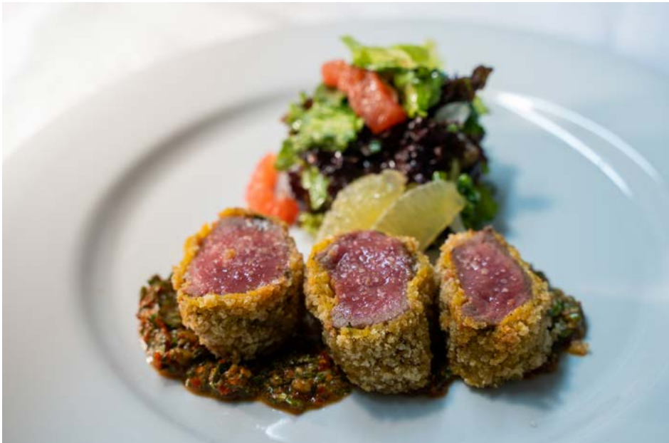
Our version of Milanesa of “Bife de Chorizo”; we deep fry it and serve it rare, or medium rare, with a green citric side salad.