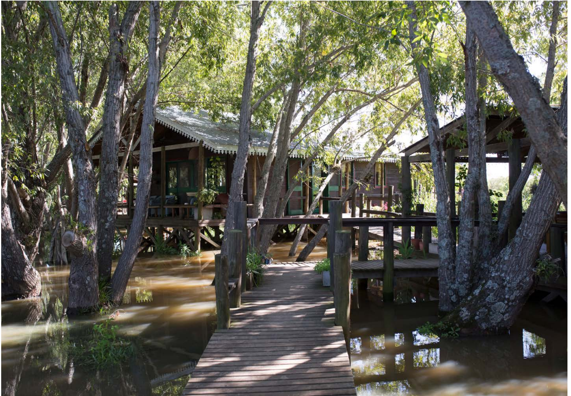
Perched above the Delta floor, the lodge is nestled amidst the low canopy and reeds. Constructed in the traditional Delta style, it features local hardwood and stands gracefully on stilts above the water.