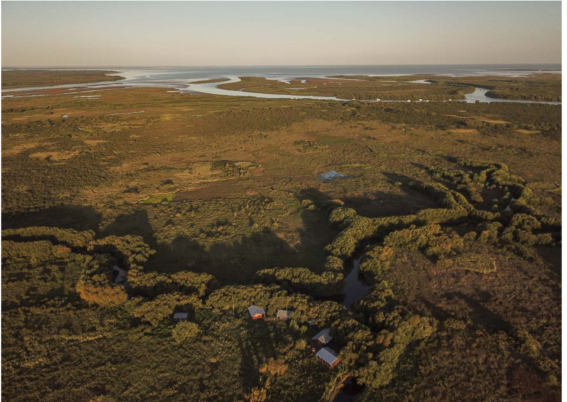
Delta Lodge is located in a biosphere reserve where the Paraná River basin ends its journey.