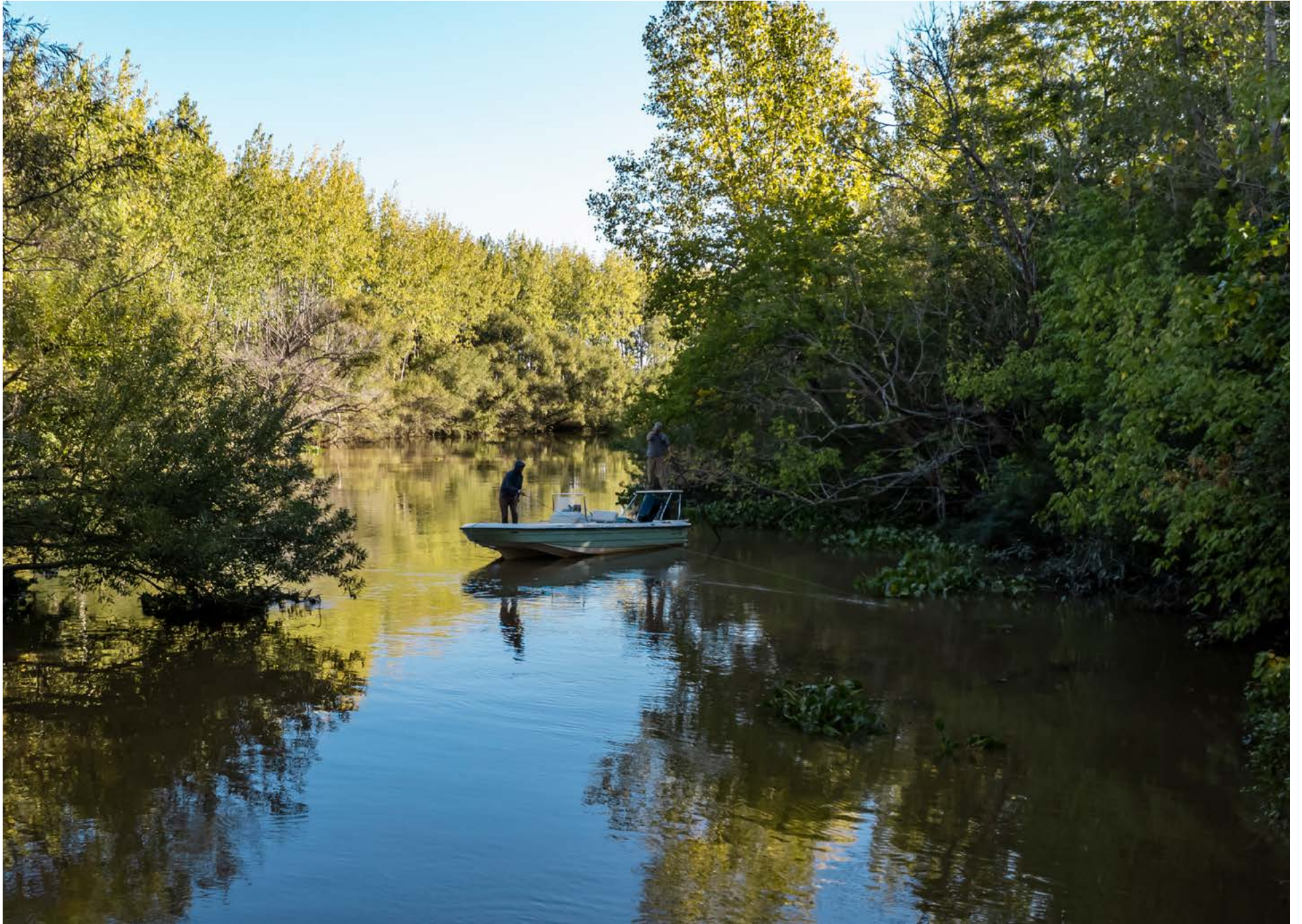
The unique fishery allows you to tuck inside braided wetlands teeming with Golden Dorado and Tarariras.