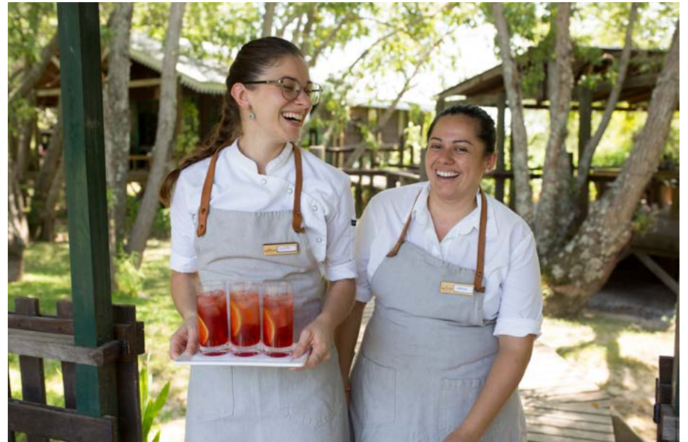
Experience warm hospitality and attentive service from our team, welcoming you with a smile every day to make you feel right at home.