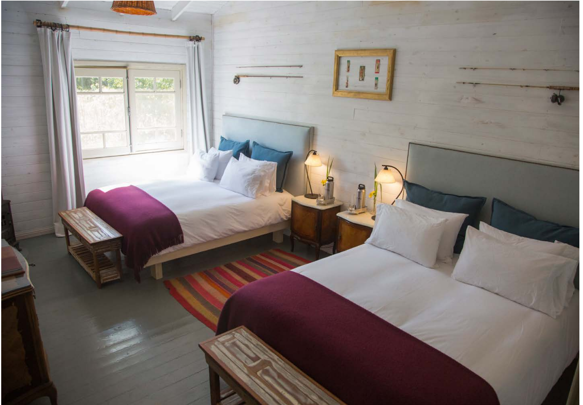
Indulge in comfort and tranquility surrounded by nature's beauty. Our lodge boasts spacious rooms, each elegantly furnished with two queen beds and a private bathroom.