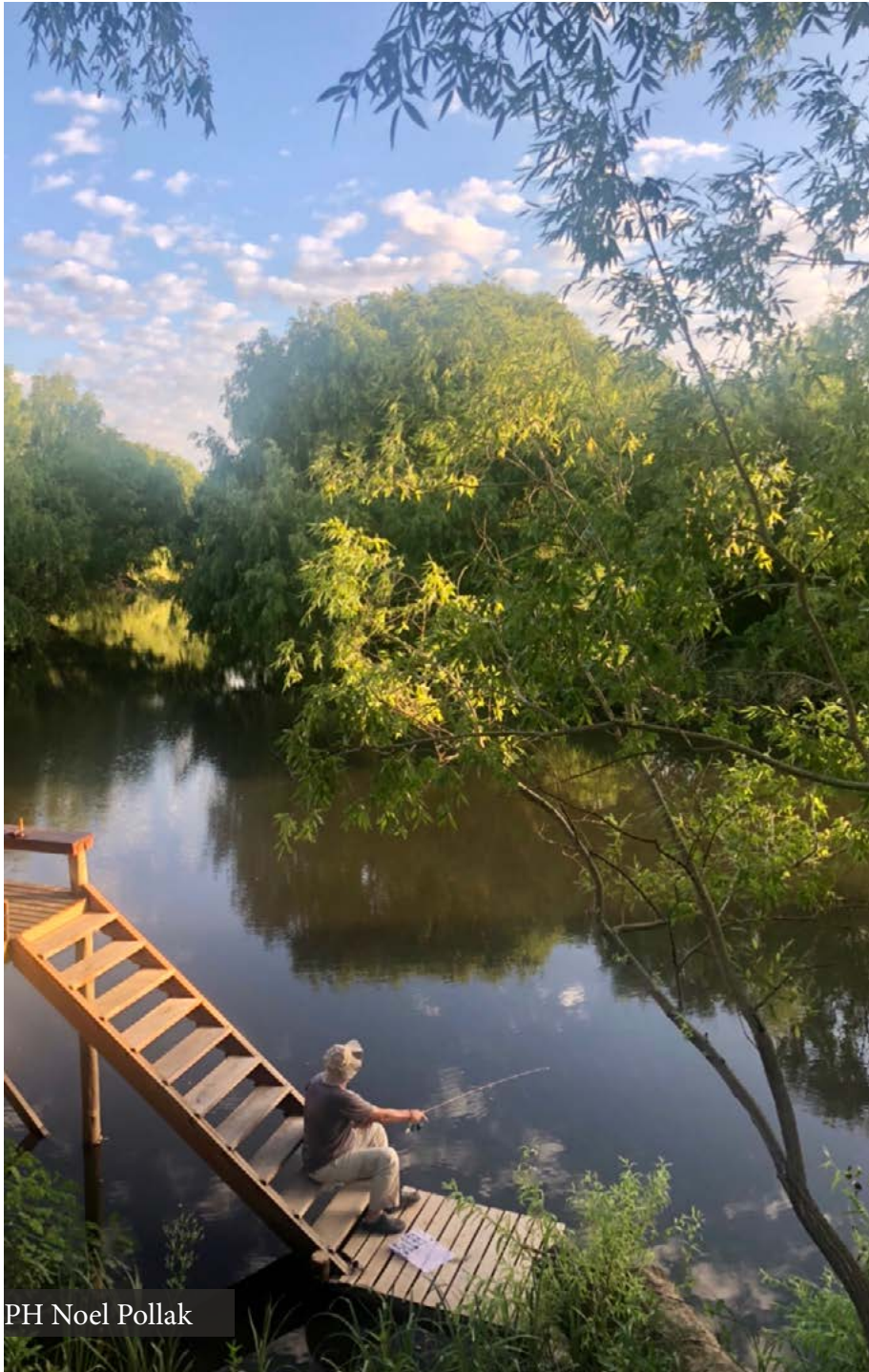
PH Noel Pollak