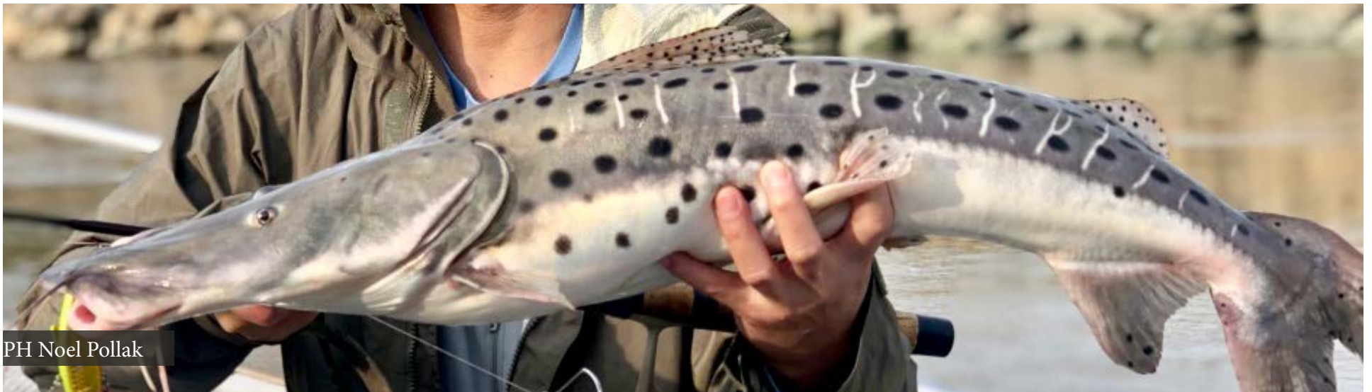
PH Noel Pollak

* Although this information represents a fairly accurate aproximation to the movement/activity of species through the year at this part of the basin, weather, water level and other factors, have an incidence too.